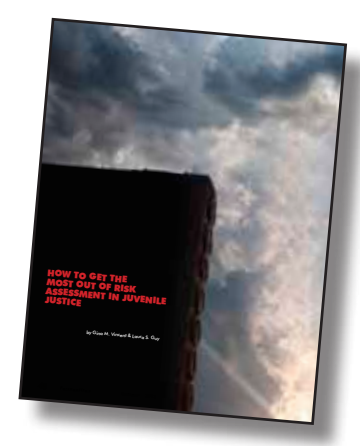
<u>Click here to download</u> the full article.

The adoption of risk assessment instruments to aid in structured decision-making has become a popular practice in juvenile justice, particularly since it was strongly recommended by Congress ten years ago in the Juvenile Justice Delinquency Prevention Act (JJDPA). Many state and county juvenile justice agencies have adopted risk assessments in the past decade, however, research suggests that few may be using these instruments appropriately in their decisionmaking (Shook & Saari, 2007). If implemented well, a risk assessment instrument can improve allocation of resources and lead to fewer youths being removed from