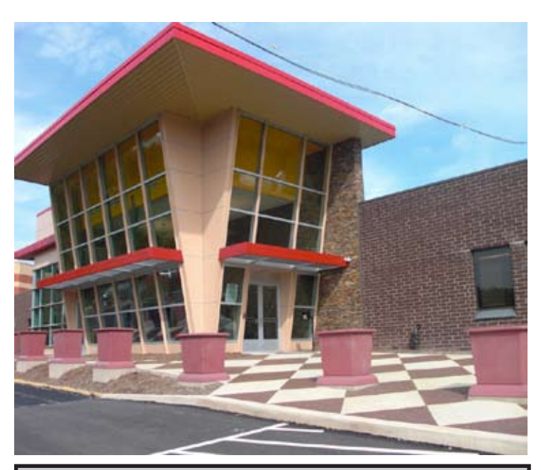
Westmoreland County Juvenile Services Center

Not only will the Probation Department be housed there, but Detention, Shelter, and a Behavioral Health Unit. The detention space will house up to 16 delinquent youth, and the shelter will accommodate 8 dependent youth. By having the behavioral health unit on site no longer will it be necessary to transport youth across town for mental health or drug and alcohol evaluations.