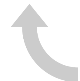
Depression & Addiction